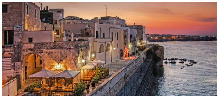
Otranto pearl of coast (half day)