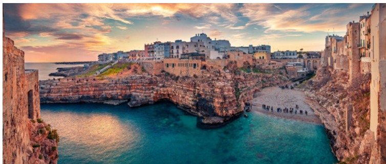
Polignano a mare, Alberobello and Ostuni white town (full day)