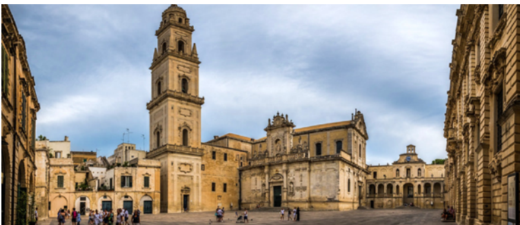
Baroc of Lecce downtown (half day)