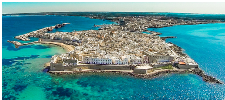
Gallipoli Old town (half day)

In the mornings during event and on rest day will be planned multiple sightseeing with guide to visit and enjoy most beautiful sites of Salento